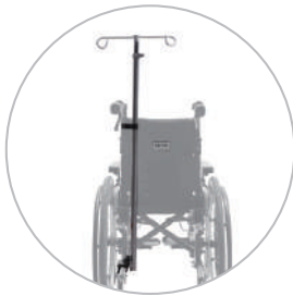
I.V. Pole Holder

Compared with ordinary table trays, this transparent table tray allows children to see obstacles around their feet when they explore on their wheelchair. The transparent tray table can provide a working platform for daily activities and offer a wider surface to support the elbows, increasing the stability of the child's upper body posture.