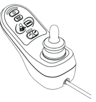
R-Net / JSM

Multi-power seat functions control with LCD screen