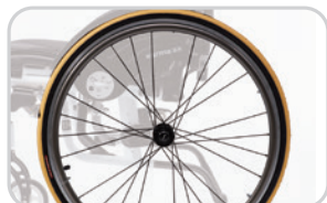
24" Lively Rear Wheel (24-spoke)