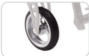
5" Aluminum Rim Casters