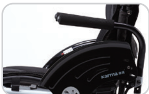
Dual Function Skirt/Mud Guard