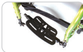
2D Flip-up One Piece Footplate