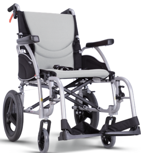
Ergo 3 Transit