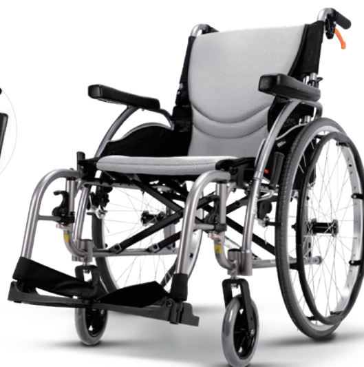
Ergo 3 Self-propel