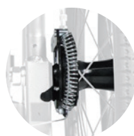
Drum Brake System (Optional)