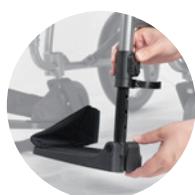
Tool-free Adjustable Footplates (Optional)