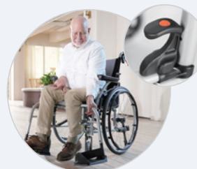
Swingaway Detachable Footrests