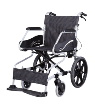
16" transport rear wheel option

Allow the wheelchair user to move closer to desks and tables.