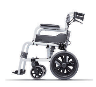
16" transport rear wheel option

Offers ample support for transfers and repositioning.