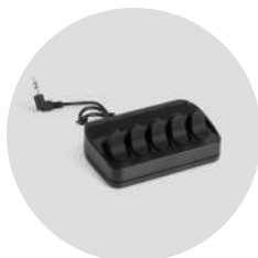
5-Button Switch Box