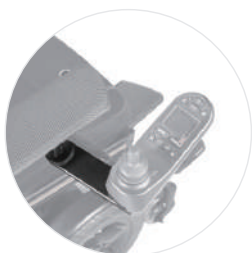
Swing-away Controller Bracket

Ideal for users with the most limited range of joint motion or those who are still acclimating to standing.