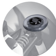
Rear Bumper Wheels