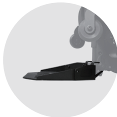
One-Piece Center-Mounted Footplate