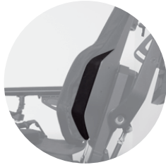
Side Support Wedges