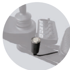
Memory Function Button