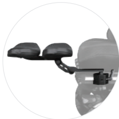
Amputee Support Pad