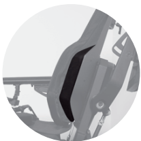
Side Support Wedges

Combine and position a wide variety of accessories for tailored support :