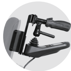
Attendant Control CJSM, lever action