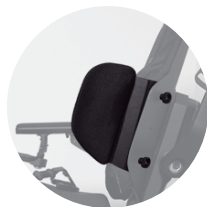
Deep Contour Side Panels