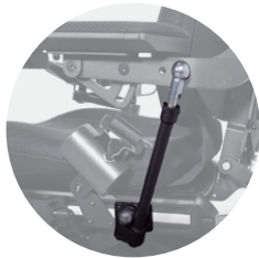
Telescopic Armrest Support