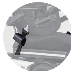
Pelvic Positioning Belt