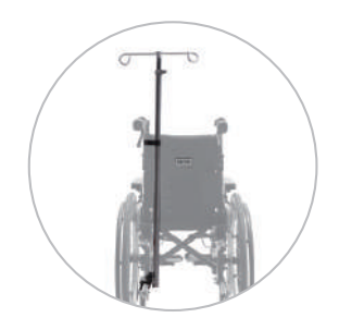
I.V. Pole Holder

Compared with ordinary table trays, this transparent table tray allows children to see obstacles around their feet when they explore on their wheelchair. The transparent tray table can provide a working platform for daily activities and offer a wider surface to support the elbows, increasing the stability of the child's upper body posture.