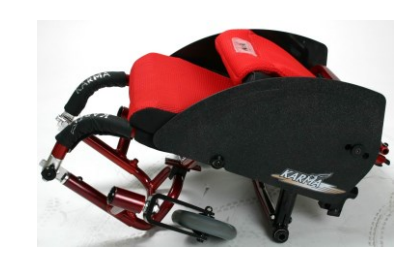
Figure 4.9 Figure 4.10 Figure 4.11